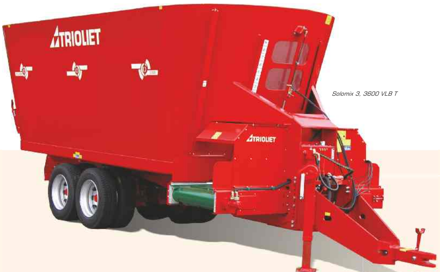
Solomix 3, 3600 VLB T

Regardless of your farm situation, Trioliet offers you a suitable machine that can distribute the required feed at all times at the right place and in the right quantity for your cows.